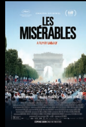
LES MISÉRABLES Ladj Ly

They entered the Oscar™ race at The American French Film Festival