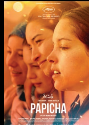
PAPICHA Mounia Meddour