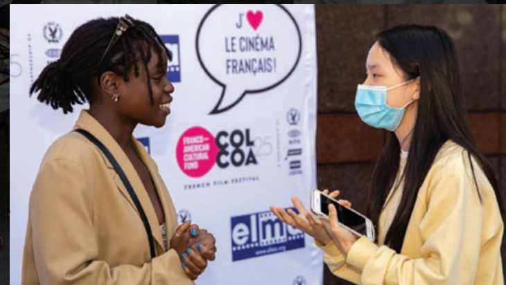
Actor Tracy Gotoas exchanges with a student post high school screening in 2021