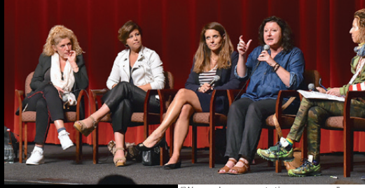
"Women's representation on screen" panel