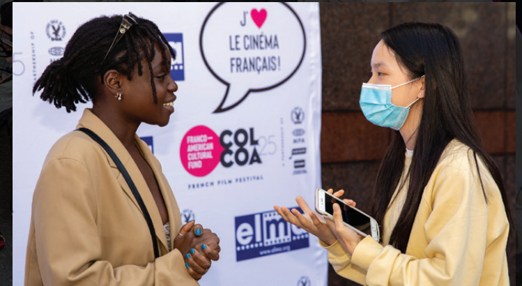
Actor Tracy Gotoas exchanges with a student post high school screening in 2021