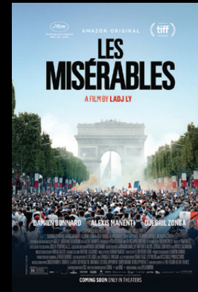
LES MISÉRABLES Ladj Ly

They entered the Oscar™ race at The American French Film Festival